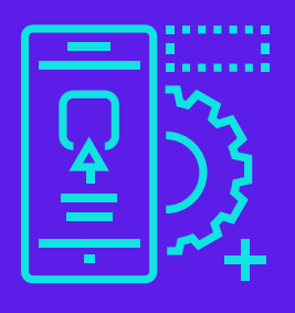
Outside China, Google Play or Apple's App Store serve 95% of all apps.

OEMs making Android devices also face tying of the free Android Open Source Project (AOSP) with the proprietary Google Mobile Services (GMS).