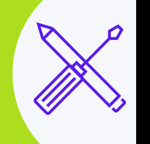
Open source opportunity: BharOS provides an alternative mobile operating system stack for device vendors in India.

OEMs making Android devices also face tying of the free Android Open Source Project (AOSP) with the proprietary Google Mobile Services (GMS).